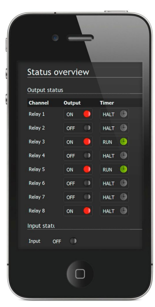
Operate the 8 relays using- your mobile device